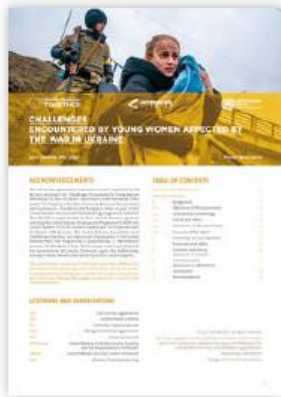
Challenges encountered by young women affected by war in Ukraine