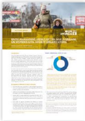
Rapid Assessment: Impact of The War In Ukraine on Women's Civil Society Organizations