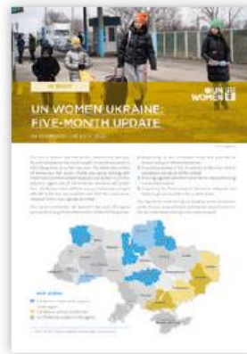
UN Women Ukraine: Five-month Update