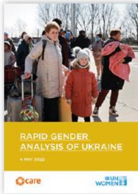
UN Women and CARE Rapid Gender Analysis