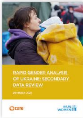
UN Women and CARE Rapid gender analysis of Ukraine: Secondary data review